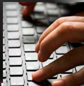
ONLINE COURSES pg 4