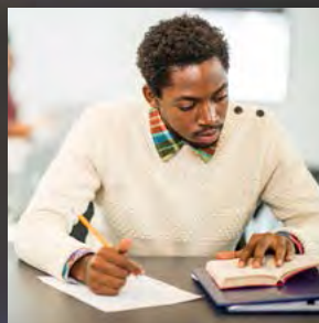
EXAM PREP pg 5

Camps designed for grades 1 through 12 with a STEM focus in a safe, fun and educational environment.