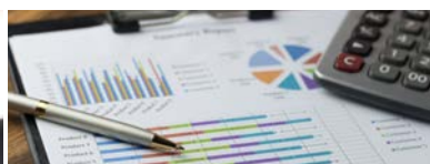
BUSINESS CONTINUITY P. 12