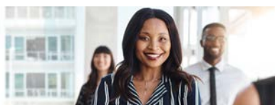
PROJECT MANAGEMENT P. 4