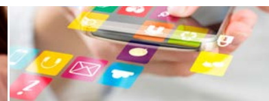
AUTOCAD P. 26